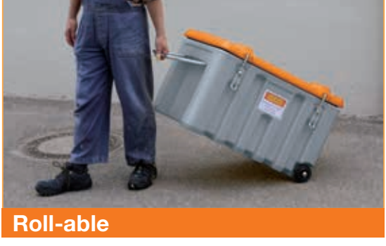
The trolley version of the 150 litre CEMbox provides a convenient solution for movement on site.