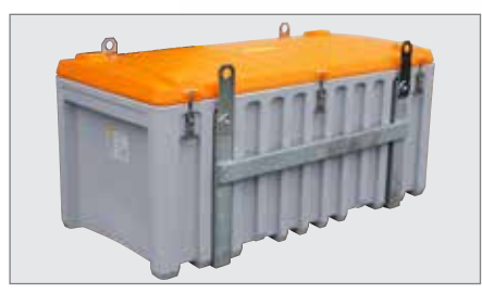
Crane framework with pivoting crane eyelets (with CEMbox 750 I for use with cranes)