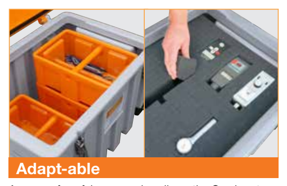
A range of useful accessories allows the Cembox to be used in a variety of ways. Compartment dividers, installable and stackable trays, foam inserts and more provide for extensive individual adaptation.