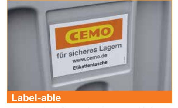
The 150 and 400 litre versions have a moulded recess to allow for marking and labelling.

Technical specifications subject to change.