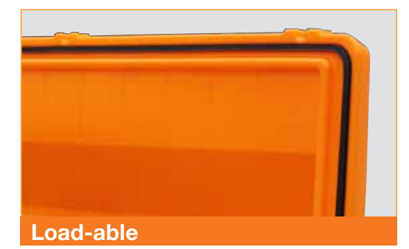
The lid is double-walled, therefore particularly stable and robust, and sealed to provide effective protection against the elements.

When you store your goods in transit in a CEMbox you can rest assured that they are safe and protected against outside influences. The CEMbox – the small, smart container for goods in transit.