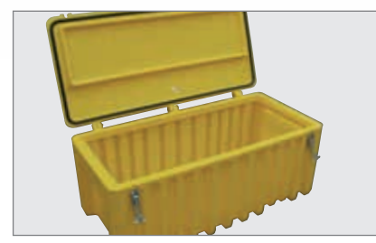
CEMbox 2501, yellow (other special colors available for orders of 50 units or more)