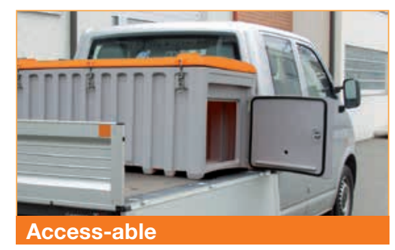
The 750 litre CEMbox with a side door offers easy and comfortable access from street level, when mounted on a vehicle.